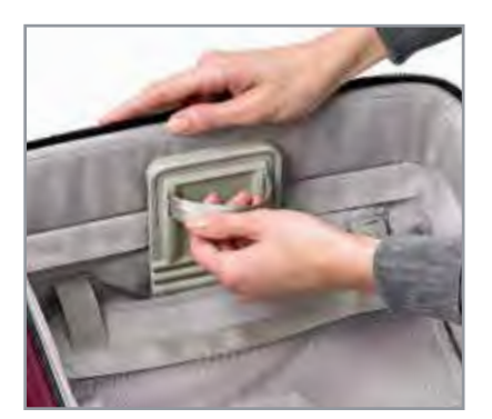
1. Expand by pulling the Transcend VX<sup>™</sup> plate to release.