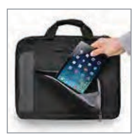
Mobile Device Pocket fleece-lined padding for added protection