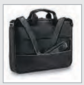
Shoulder Strap Pocket tucks away strap when not in use