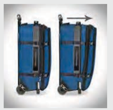
Start trip with unexpanded bag; expand as needed for gifts and souvenirs