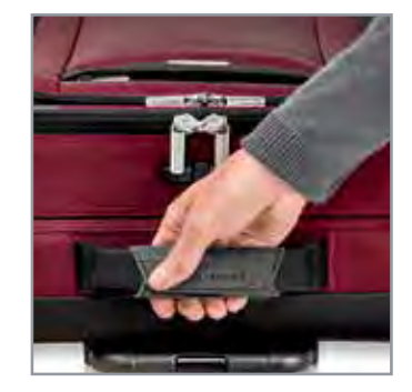
Soft-Touch Handle Grip ergonomically designed for maximum comfort and easily removable and replaceable