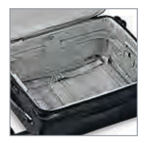
Compression Panels securely cinch clothing to prevent shifting in transit