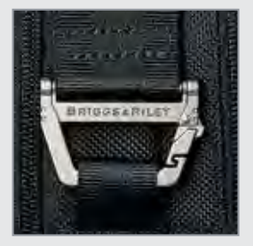
Removable Strap with sleek gunmetal finish hardware