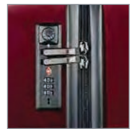
Built-in TSA-Friendly Lock combination lock for security of contents