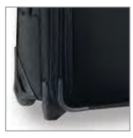
Wedged Feet deflect impacts, reducing damage (Uprights<sup>®</sup> only)