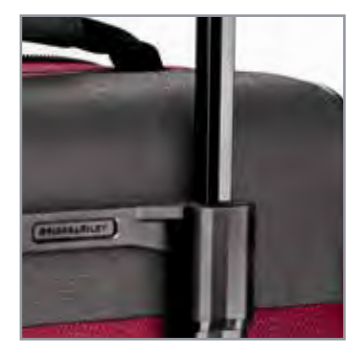
PermaSquare<sup>™</sup> Fabric strategic placement of ultra-durable fabric in abrasion-prone areas