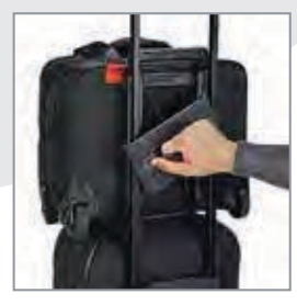
Interlocking Handle securely fastens a rolling brief atop any Briggs & Riley rolling Upright® or Spinner