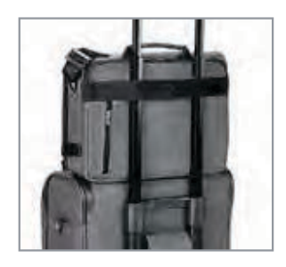
Slip-Through Back Strap slides over an Outsider® handle for easy transportation