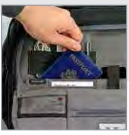
RFID Blocking Pocket protects personal data against digital pickpockets