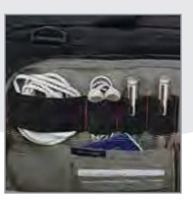
CordControl<sup>™</sup> Loops elastic bands to secure gadgets