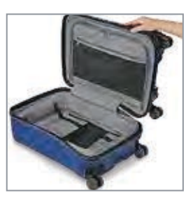
80/20 Lid Opening opens like a traditional suitcase to pack on a luggage rack