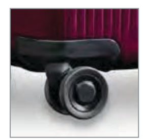
Double Swivel Wheels low center of gravity for ultimate maneuverability