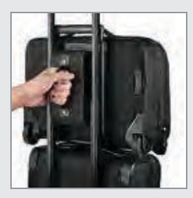
Interlocking Handle securely fastens a rolling brief atop any Briggs & Riley rolling Upright® or Spinner