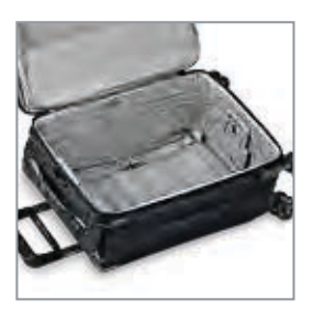
Large Flat Interior no bars for neat and wrinkle-free clothing