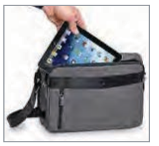
Padded Tablet Slip Pocket protects iPad® or other tablet in or out of its case