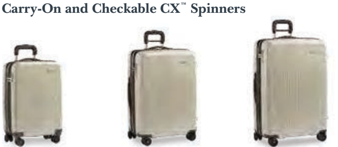
Large Expandable Spinner SU130CXSP 30x20x12 in. 76x51x30.5 cm (exp. to 15 in./38 cm d) $679