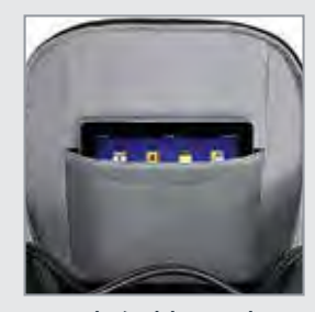
iPad®/Tablet Pocket fleece-lined padding for added protection