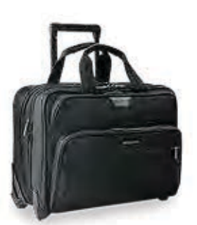
Large Expandable Rolling Brief KR350X 13x17.5x8 in. 33x44.5x20.5 cm (exp. to 10.5 in./27 cm) $479