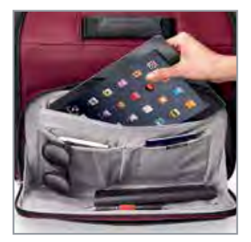
Padded Tablet Slip Pocket protects iPad® or tablet in or out of its case