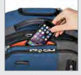
SpeedThru<sup>™</sup> Pocket holds small items at security checkpoints