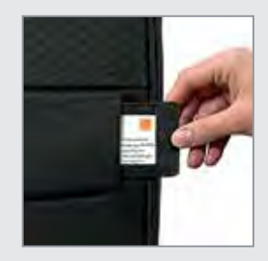
HideAway<sup>™</sup> ID Tag conceals personal information