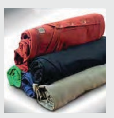
Maximize space by rolling clothes