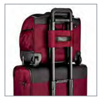
Interlocking Handle System securely fastens a Rolling Cabin Bag atop any Briggs & Riley Spinner or Upright®