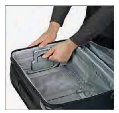
Expand your suitcase by releasing the CX<sup>™</sup> mechanism on both sides.

You can travel lighter, easier, faster and smarter with Baseline CX<sup>™</sup>. Revolutionary CX<sup>™</sup> compression-expansion technology allows you to pack up to 34% more and still meet airline carry-on requirements. By compressing your clothes securely in place, they'll arrive wrinkle-free, the way you so carefully packed them.