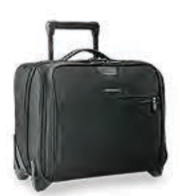
Medium Slim Rolling Brief KR251 12x16x6.5 in. 30.5x40.5x16.5 cm $389

Medium Expandable Rolling Brief KR250X 12.5x16.5x7.5 in. 32x42x19 cm (exp. to 10 in./25.5 cm) $439