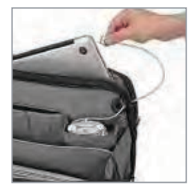
CordPass™ allows laptop to stay inside bag while charging