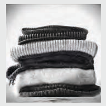
Pack color-coordinated clothing