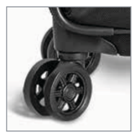
Double Swivel Spinner Wheels for effortless 360° navigation