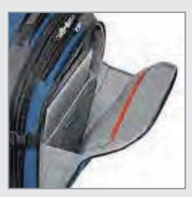
Large Front Pocket with padded laptop compartment for easy access in transit