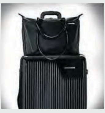
Carry on a coordinating tote