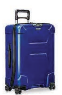
Medium Spinner QU127SP 27x18.5x11.5 in. 68.5x47x29 cm $549