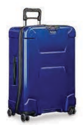
Large Spinner QU130SP 30x20x12 in. 76x51x30.5 cm $599