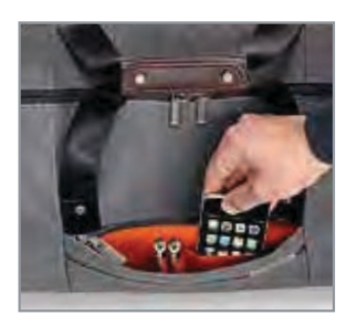
SpeedThru<sup>™</sup> Pocket holds small items at security checkpoints