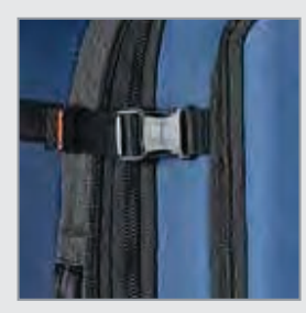
Compression Straps cinch contents to minimize wrinkling