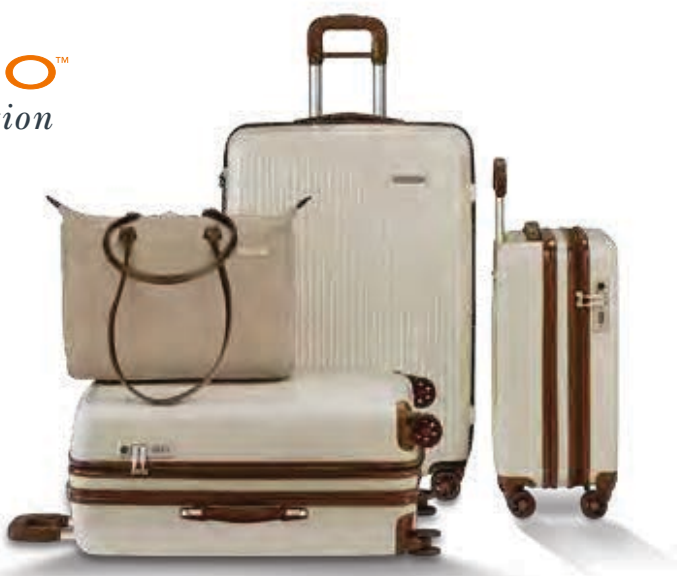
Shown: S145 atop SU127CXSP, SU130CXSP, SU121CXSP

Go the world over without leaving luxury and style behind. Introducing Sympatico Caramel & Cream Limited Edition, featuring spinners and coordinating soft bags.