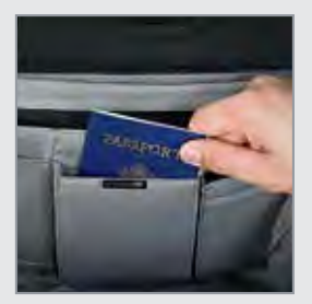
RFID Blocking Pocket protects personal data against digital pickpockets