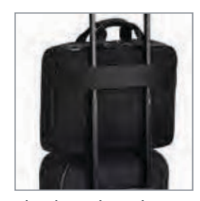
Slip-Through Back Strap transports brief atop any Briggs & Riley Upright®