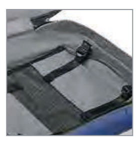
Compression Panel securely cinches clothing to prevent shifting in transit