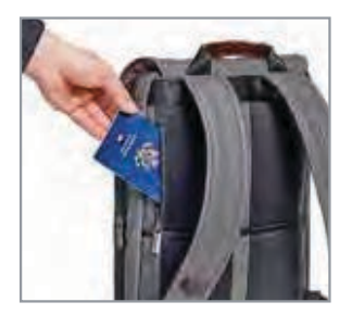
Hidden RFID Blocking Privacy Pocket keeps passport and other small personal items close and secure