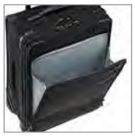
Gusseted Front Pocket hassle-free storage of extra items

3. Simply compress down to original size.