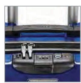
Briggs & Riley Control Panel™ built-in TSA-friendly combination lock