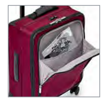
Large Gusseted Front Pocket Wide opening for easy access to extra items like a jacket or sweater