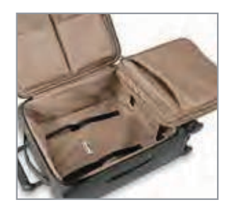
Compression Panel converts to removable and washable laundry bag