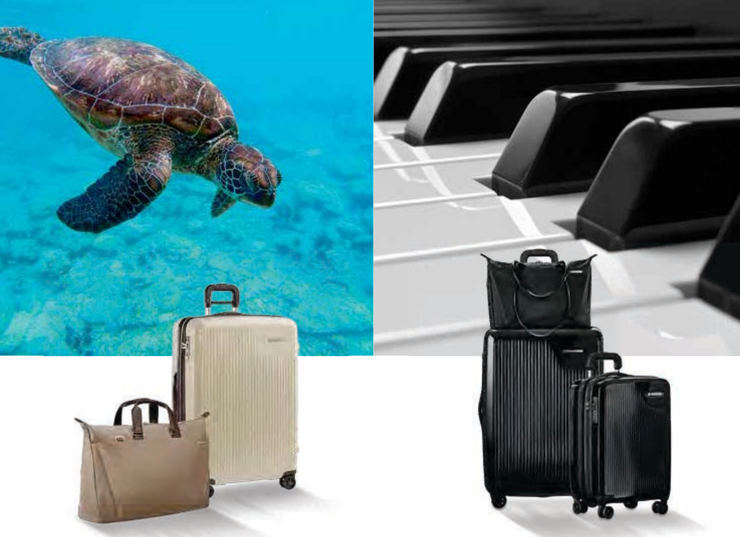
Strength. Beauty. Grace. Limited Edition Sympatico<sup>™</sup> Caramel & Cream.