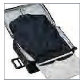
Built-In Suiter keeps suits and garments wrinkle-free (select styles)