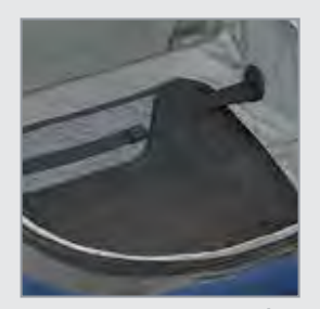
Compression Panel cinches contents to prevent shifting in transit