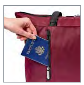
Hidden Privacy Pocket keeps passport and other small personal items close and secure