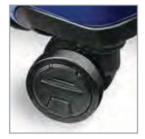
Double Spinner Wheels smooth 360° motion and quiet rolling