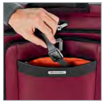
SpeedThru™ Pocket holds small items at security checkpoints; orange lining alerts you if pocket is open