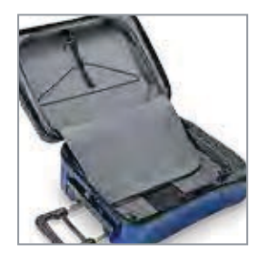
Built-in Garment Carrier gently folds hanging items to minimize wrinkling