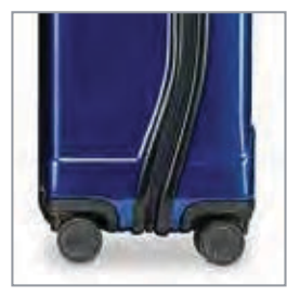
Wide Wheel Base exceptionally wide, tilt-resistant for maximum stability