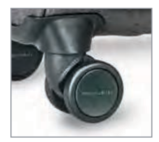
Double Swivel Wheels smooth 360° motion and quiet rolling