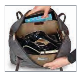
Spacious Interior with dedicated pockets for organization