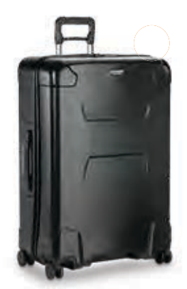
Extra Large Spinner QU132SP 32x22x12 in. 81x56x30.5 cm $669