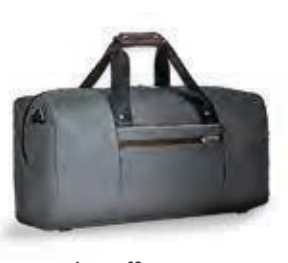
Simple Duffle Z150 10x21x8.5 in. 25.5x53.5x22 cm $249 ●●